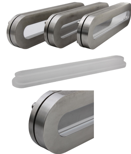
Special design option b) with stepped glass